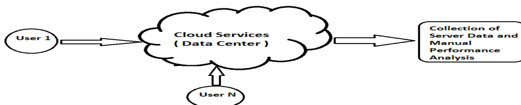
Fig. 2 Architecture for Existing System

In existing system, the performance of cloud services are calculated by using statistical approach like collecting the data from the server and checking whether the end user getting reached the quality of the particular service or not. The following diagram depicts the architecture of existing system.