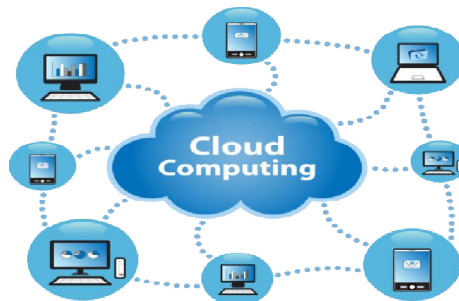
Fig. 1. Illustration of Cloud Computing

As the definition and basic concepts is already discussed in introduction section. According to various researchers, Cloud computing will be used 100 percent of the users in the coming days. Cloud means moving from one place to other in general. Likewise, the technology can be accessed from anywhere in the world through the internet. Some of the terminologies related to cloud computing are SLA, Service Provider, and Virtual Migration and so on. The following diagram depicts about cloud computing: